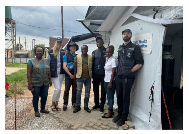
Assessment of Chipata CTC, MoH/WHO, Lusaka, Zambia