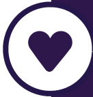
Table 5. Safety climate/culture change (live it)