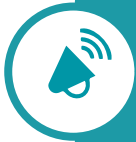
Table 4. Reminders and communications (sell it)