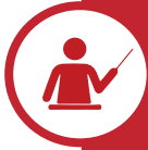
Table 2. Training and Education (teach it)