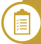
Table 3. Monitoring and feedback (check it)